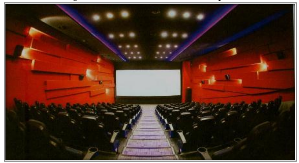
Fig. 3. Inside View of Attrium Karachi Cineplex